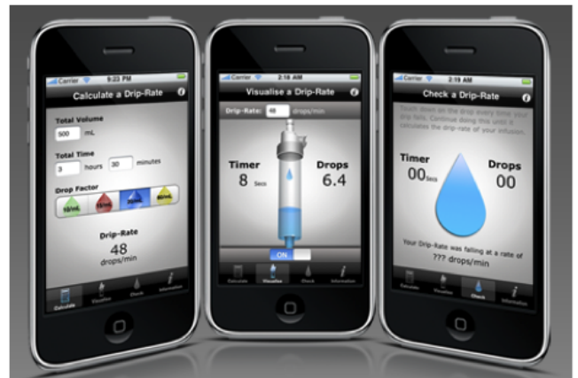
Figure 1: App to help nurses carry out intravenous drip-rate infusions.

Infusion therapy, relating to administering medication fluids to a patient intravenously, is one of the most frequent practices within the healthcare domain. In the UK National Health Service (the NHS) around 15 million infusions are