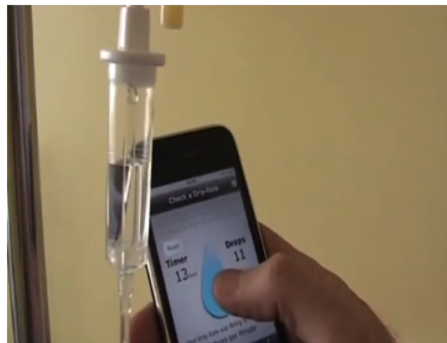
Figure 4: Interface for checking drip-rate. The user taps the screen each time a drop falls.

Figure ?? shows the user interface for supporting the setting of a drip-rate. Users first enter the drip-rate value, which may or may not have been calculated using the calculate feature. Once a drip-rate value has been entered, checks are made to ensure the value is not over the threshold limit. Once the value has been validated and approved, the visualization can start. The visualization mimics the design and characteristics of a real drip chamber. Drops will fall from the top and down into the chamber, repeatedly at the speed of the dripping rate that was entered by the user. When this visualization begins, a timer and counter also begins. The timer starts from zero and counts the time the drops. The counter counts the number of drops that have fallen for each second. This visualization feature is further supported by the use of sound (“drip falling” sound) and vibration feedback when a drip falls into the chamber, to guide the user