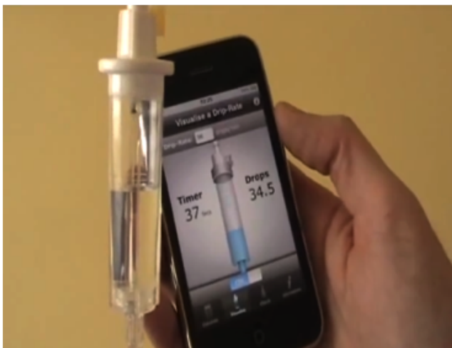
Figure 3: Interface for setting a drip-rate. The user adjusts the clamp to synchronize the real drip chamber (shown on the left) with the visual animation on the app.

the chances of decimal point errors [?].